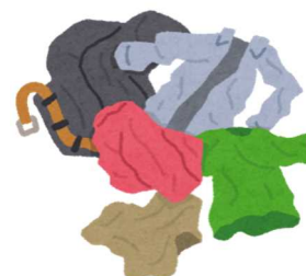
Recycling of used clothing, etc.