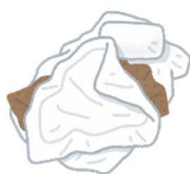
Paper that cannot be recycled