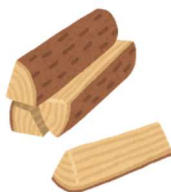
Wood chips and branches