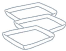
Trays for side dishes etc.

Items that can be disposed of as plastic have the following markings: