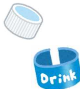
PET bottle caps and labels