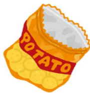
Bag of sweets